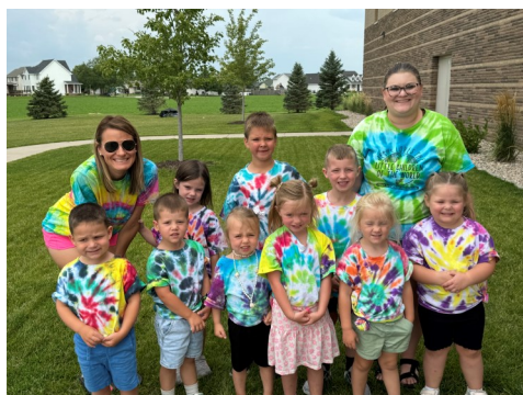
ELC Preschool Summer Camp