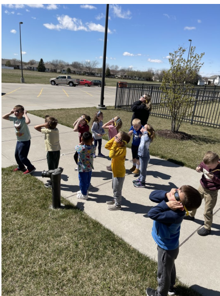
Preschoolers viewing the eclipse